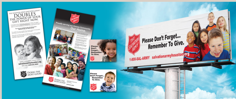
Salvation Army | Houston